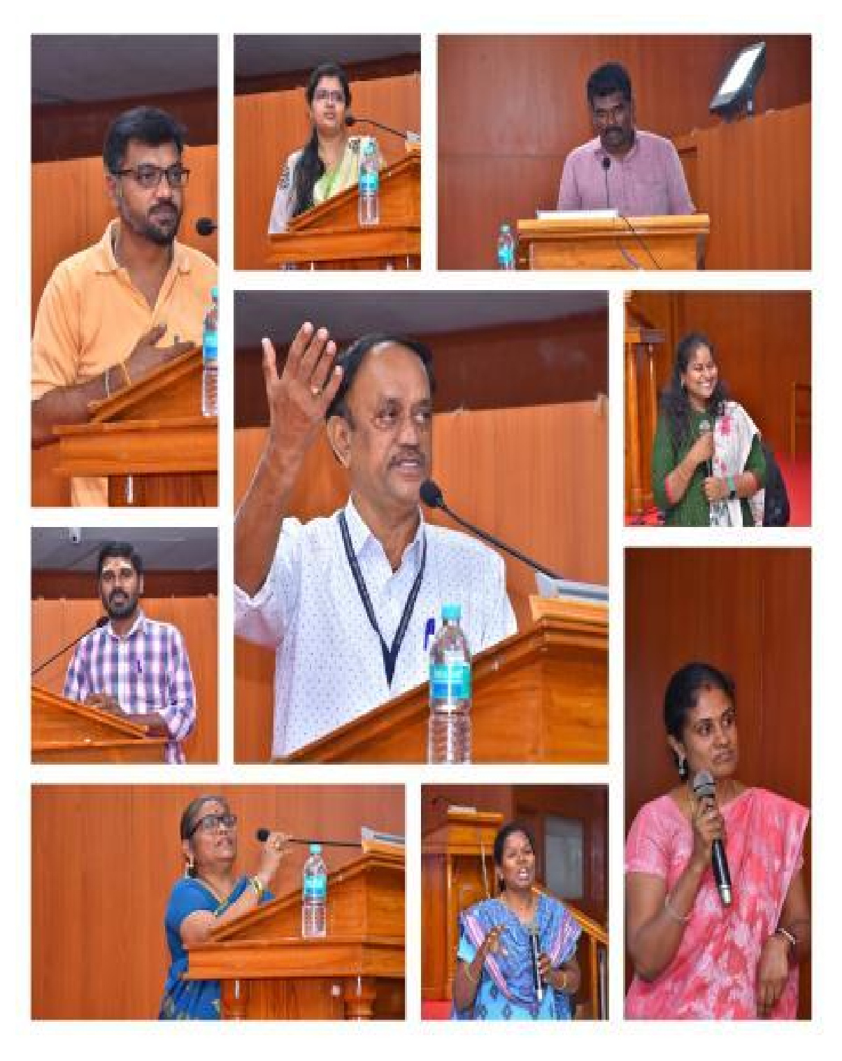
Report of the Event

https://drive.google.com/file/d/10sTfKAF0q3vxgzRQMYaE0b oWzXz_jfCL/view?usp=share_link